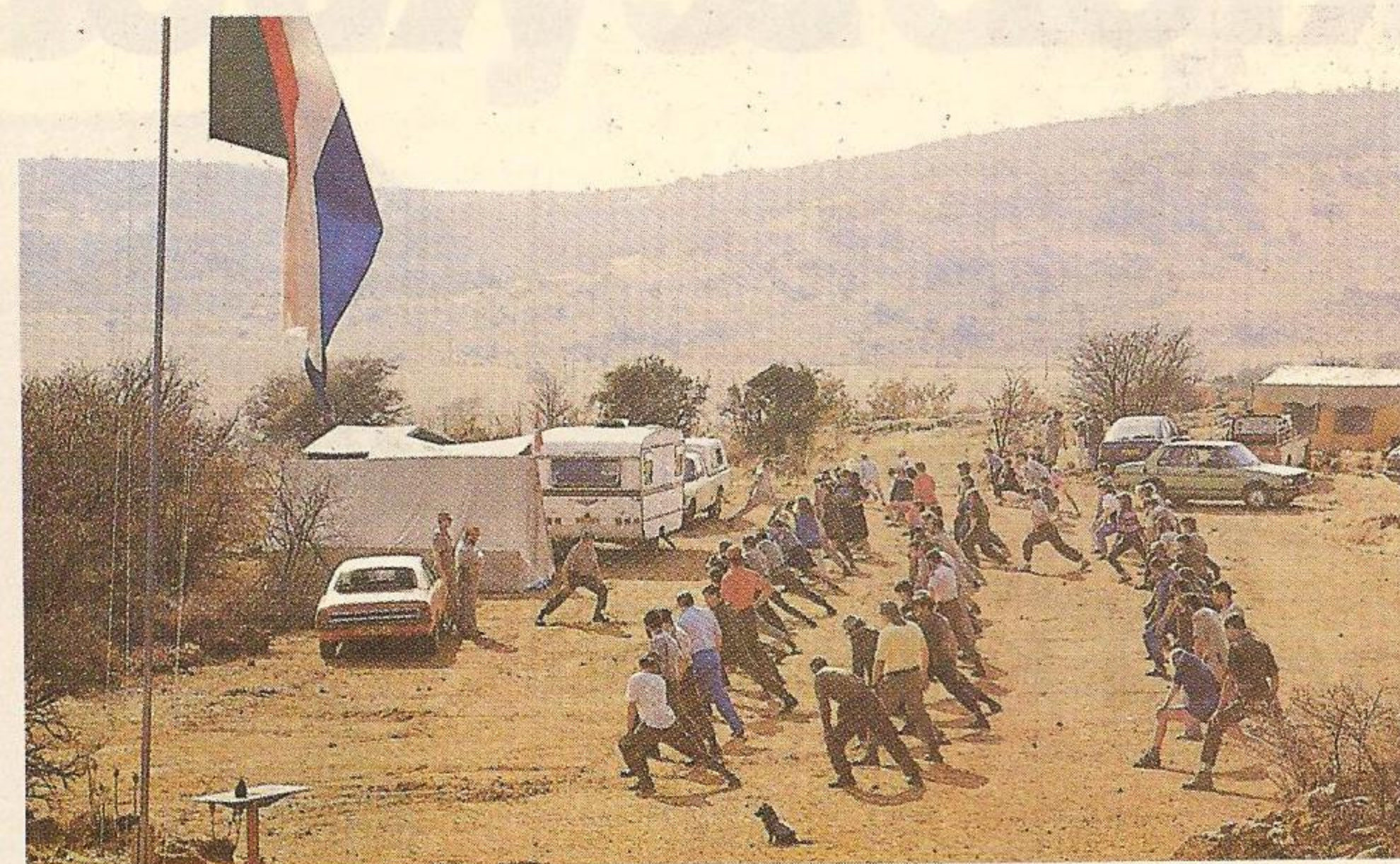
With Mandela unable to control the former ANC gangs, only the worst fool walks the streets unarmed and unprepared — adding to the popularity of AWB family training camps.