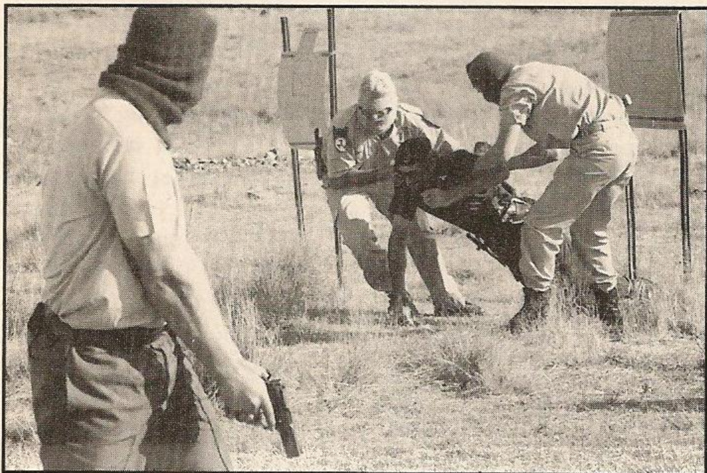
Former SADF special forces and Recce personnel train under the instruction of British SAS officers and mercenaries from Israel, Ireland and Holland.